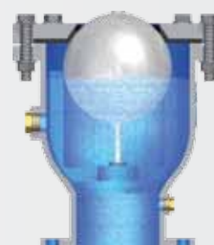
The valve is permanently closed until there is a detection of depression.