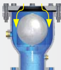
Evacuation of large quantities of air during the filling